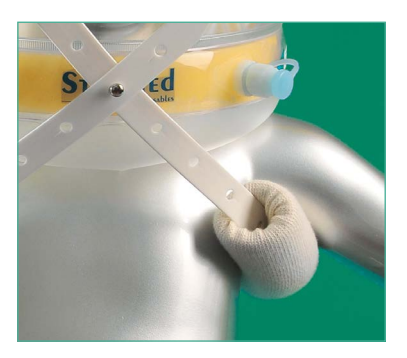
Critical Care • Non-invasive ventilation • STARMEd