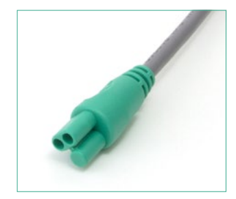
Critical Care • Humidification Accessories