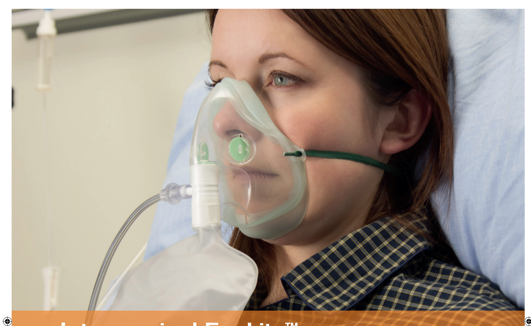
Information Sheet • Oxygen and Aerosol Therapy