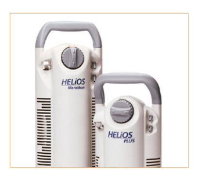
Oxygen and Aerosol Therapy • Nasal Cannulae