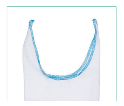
Critical Care • Breathing Systems